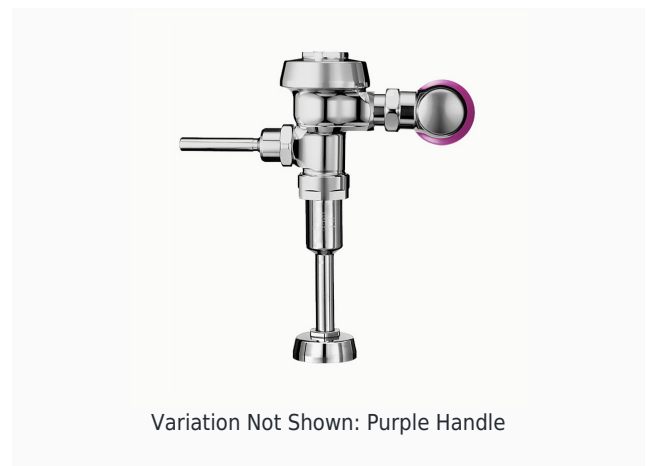
Variation Not Shown: Purple Handle